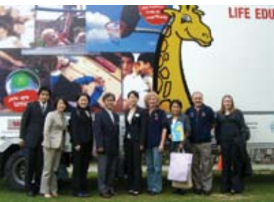
With representatives of Life Education Trust, at Discovery School, Whitby.

The programme included presentations on policy and initiatives by staff of the Ministry of Youth Affairs, and in-depth discussions with specialists in the areas of training and employment initiatives, health and wellbeing education, suicide prevention and dealing with at-risk youth and young offenders. A particular interest of the group was how New Zealand encourages volunteer support for Youth-based activities and the funding mechanisms for delivering them. Meetings with the New Plymouth District Council Youth Sub-committee and school representatives provided the opportunity to hear from young people themselves how they directly participate in forming a society in which Youth is fully engaged.